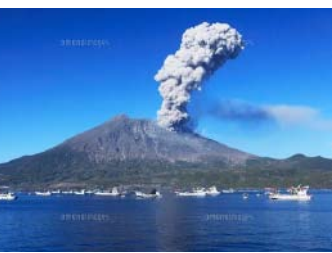
1 Hour 30 Min