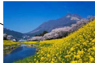
2 Hours 10 Min