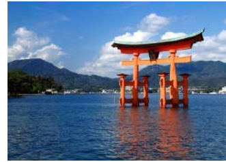
1 Hour For Hiroshima