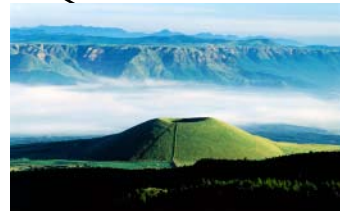
70 Min * From JR Kumamoto Sta. 2 Hours * From JR Beppu Sta.