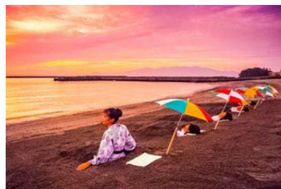
Sand bath(Ibusuki) 1 Hour from JR Kagoshima-chuo Sta